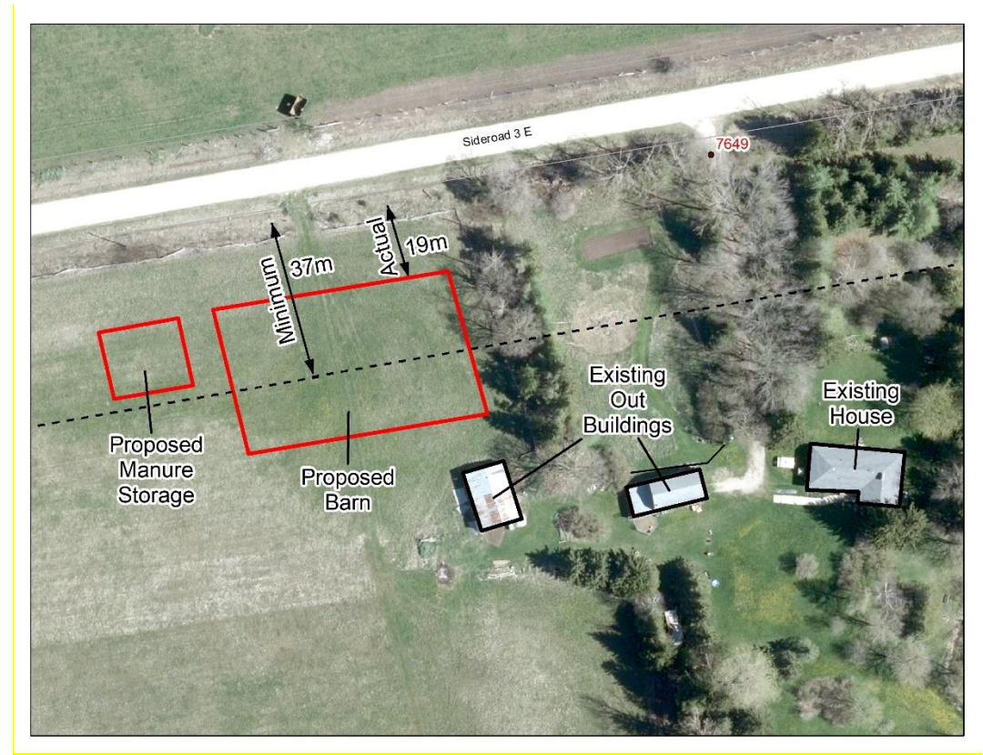
Figure 1: Aerial Photo indicating existing and proposed uses on the subject lands